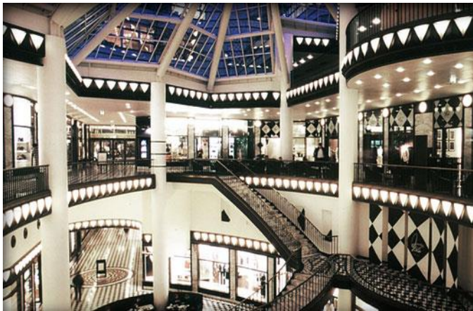
Quartier 206, Berlin, Adviser