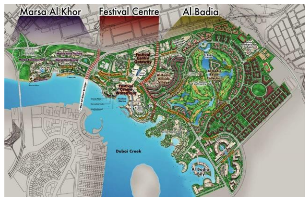
Dubai Festival City, Dubai, Adviser