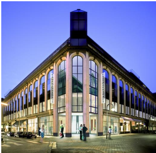
Kaufmannshaus, Hamburg, Project