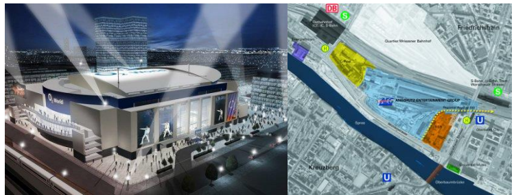
O 2 Arena Areal, Berlin - (Project) - Anschutz Entertainment Group -