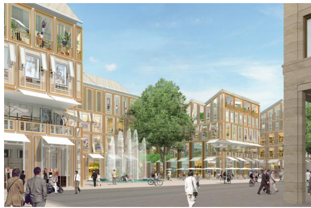
Stubengassen, Münster, Project