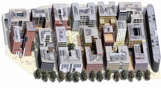
Stadtwerk, Frankfurt (Project)