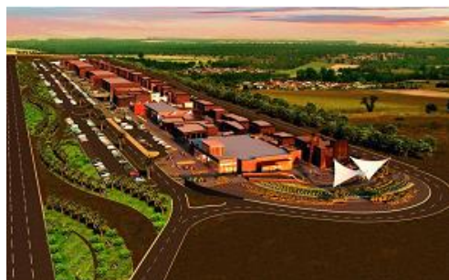
Designopolis, Cairo - Egypt, Adviser