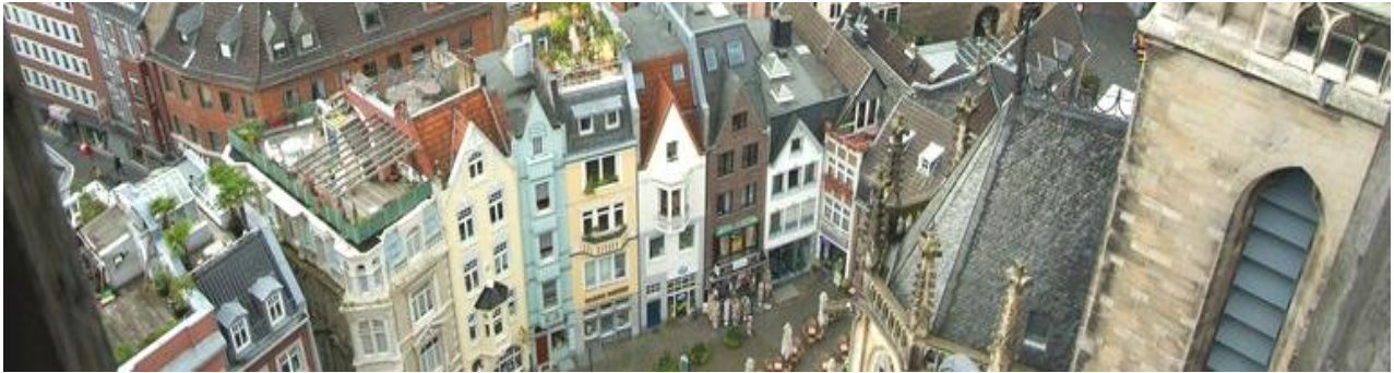
Aachen Old Town – project related trend study 2014 / 2016