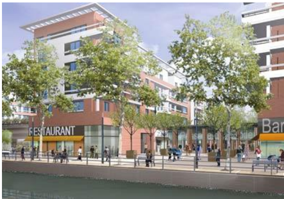
Rivetoile, Strasbourg, Adviser