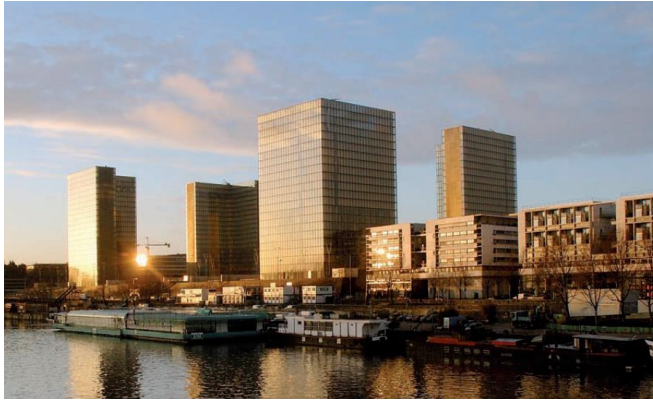
Paris Rive Gauche, Paris , Project