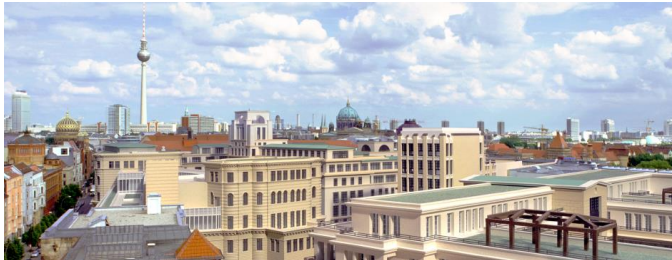
Quartier am Tacheles, Berlin ( Project )