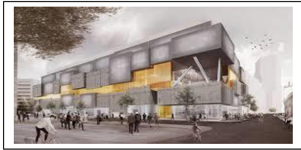
VOLT Berlin 2015, Utilization Mix, Adviser