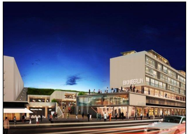
Bikini, Berlin, Adviser