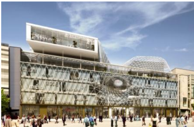
MyZeil, Frankfurt, Adviser