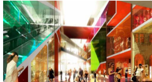
Haus Cumberland, Berlin, Project