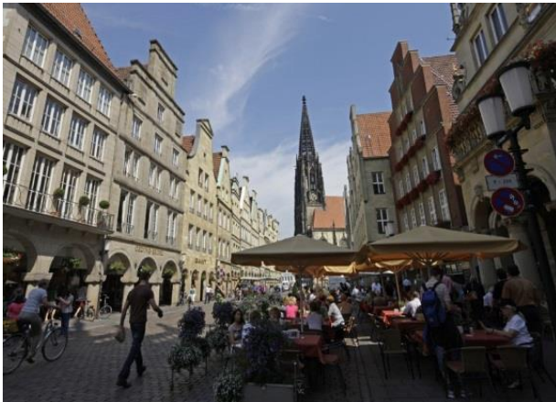
Münster Hansetor – Mainstation – project related Trend Study 2016