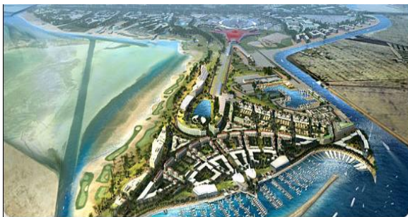
Yas Island, Abu Dhabi, Adviser Cooperation with Lunson&Mitchenall, UK