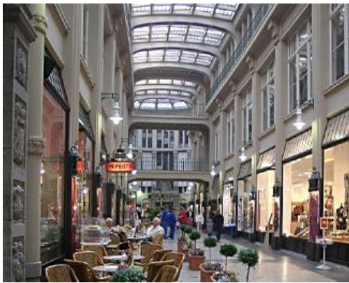
Maedler Passage, Leipzig, Adviser