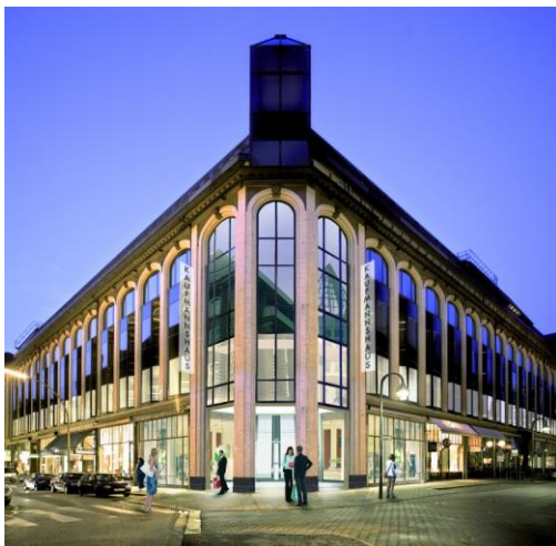
Kaufmannshaus, Hamburg, Project