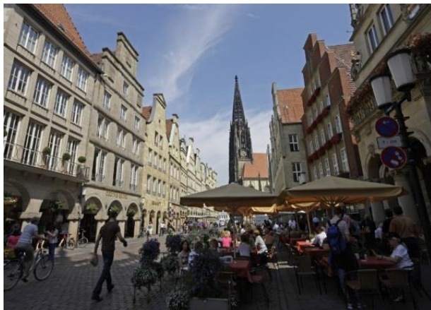
Münster Hansetor – Mainstation – project related Trend Study 2016