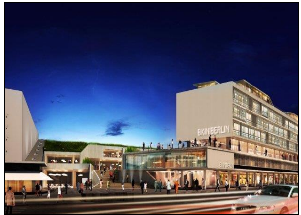
Bikini, Berlin, Adviser