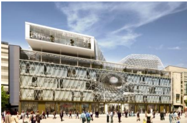
MyZeil, Frankfurt, Adviser